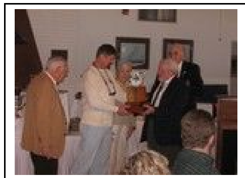
Installation and Awards 2008