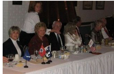
Snap of Installation 2007

The annual Awards Banquet and Installation Dinner are coming up this month. You won't want to miss this terrific event. The layout has been changed a bit this year, breaking the event into two categories, Awards and Installation, at different times on the same day, January 27 th . Look for more information within this Letter Log for more information. Make your reservations early, seats are already booking up.