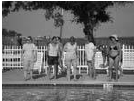
Racing for that rose can be tiring!

Since the Commodore has covered the Race for the Roses (the female-only regatta which was their 20-year celebration this year) in Pensacola Beach, I will simply add my thanks to all those that participated, loaned their boats, supported all of us while we were racing and otherwise contributed to the overall spirit of the day. All the crews really appreciated the support that the FWYC gave us.